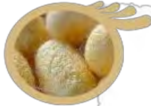
SILK Hydratation and smoothness.