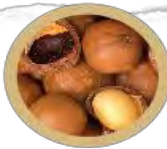
BRAZIL NUT OIL Extreme shine and nutrition.